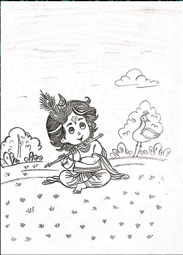
Anu keerthika.K III EEE