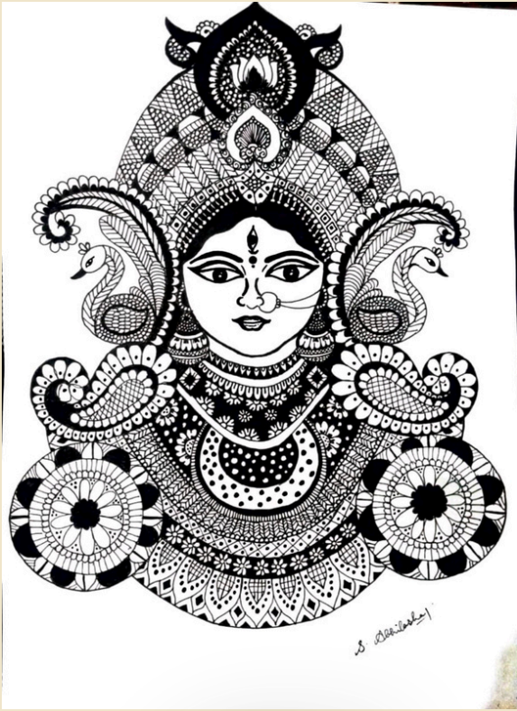
-Abhilasha S II EEE